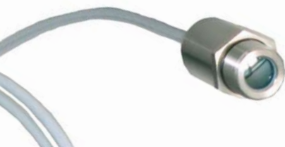
Picture 1: Small PSC CT LT sensing head; Heads installed in a machinery with laminar air purge collars for temperature monitoring during thermoforming