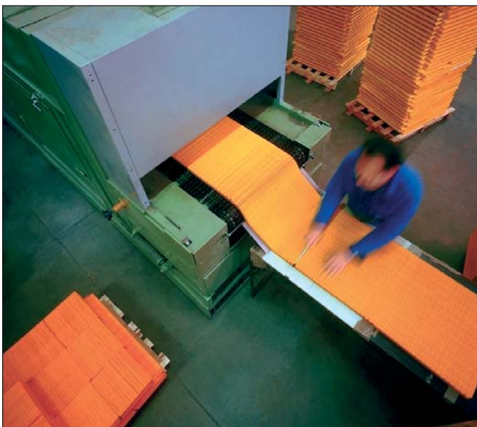
Picture 2: Permanent temperature monitoring at an embossing calender, supported by the infrared thermometer PSC CT LT

The original material is heated up to 190°C with a basic temperature within an infrared radiator and homogenised. The material is then transported to the heated embossing calender where it receives a product specific structure. A defined cool down in the cooling range closes the process.